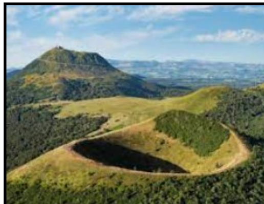
The Sancy Massif