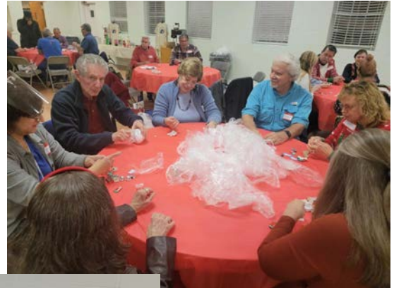
Farther along with unrolling the ball!