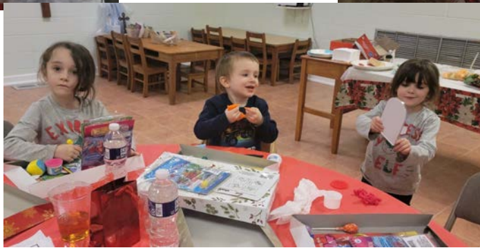
Children with their presents.