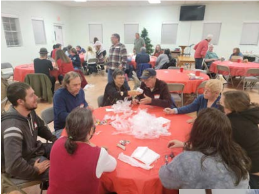
Playing the Saran Wrap Game.