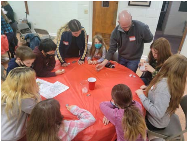
Playing the game, Family Style.