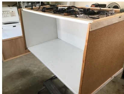
Below Center: The light wiring harnesses were reorganized and bundled. Additionally, the inside received a coat of white paint.