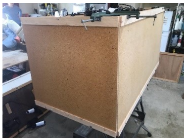
Bottom Left: The new support mounting hardware are clamped to walls.