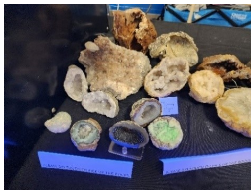
Judy's geode collection on display at Ocean Lakes Elementary STEM night... several are fluorescent.

Judy Hyszczak, thanks for putting in extra work behind the scenes printing all the handouts and signs for all four events. Also, for lending us many of your beautiful geodes so we could fulfill a specific request by Ocean Lakes Elementary school.