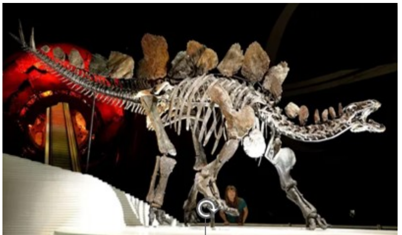
Sophie the Stegosaurus was a young adult when she died 150 million years ago. Many of her bones have been laser and CT-scanned to study within computer simulation programs. She currently resides in the London Museum of Natural History.