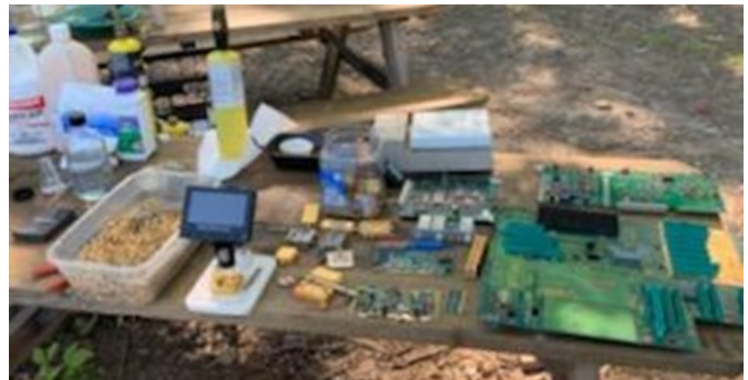
A display table with a digital microscope, pay dirt and various uses for gold.