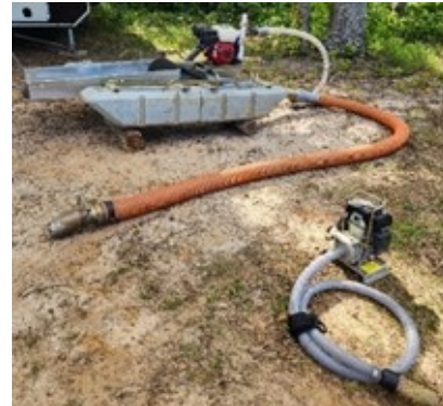
Floating dredge (top) & hand