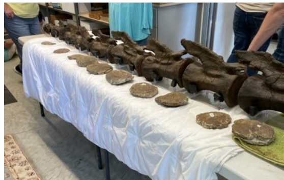
Top right: Bob Simon Middle right: femur to work on Bottom right: Spine worked on and all cleaned up