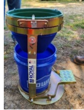
A bucket top classifier with foot pedal.