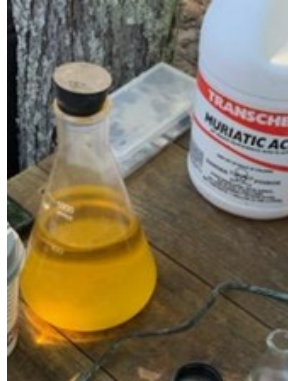
Muriatic acid to remove impurities from the gold.