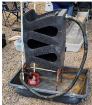
Two different styles of High Bankers.