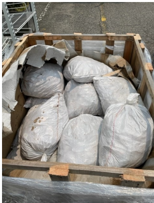
Inside the crate - lots of heavy bags!