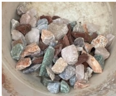
Sampling of rocks for the bags.