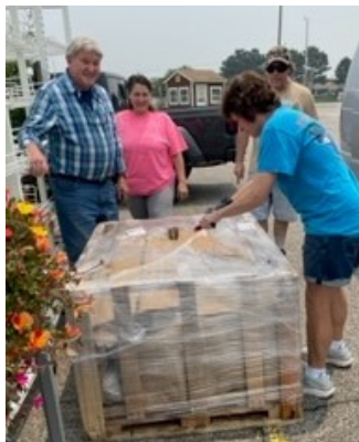
Crate of rocks delivered to us at the Farmer's Market