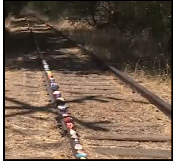
Rockwell the Snake in its new home.

One little girl, named Liberty Sellers loved hiding treasures for people to find. She begged her parents to make a rock snake in Rockwell, Utah. When the project reached 100 rocks, Liberty was thrilled. And then it increased to 200... and then it grew to 300! With every milestone she was so excited. The Rockwell snake had reached 500 rocks in only 2.5. weeks.