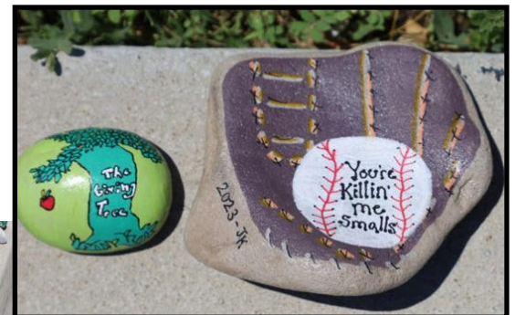
Two special rocks