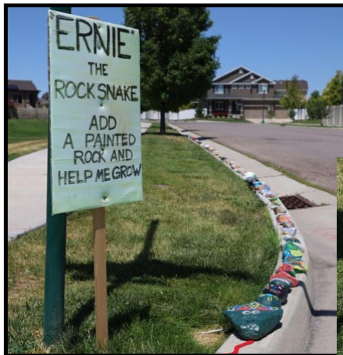
Ernie, the rock snake in Riverton, UT. Notice how long he is in the picture?