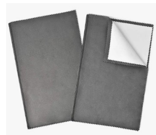
Silver Polishing Cloth